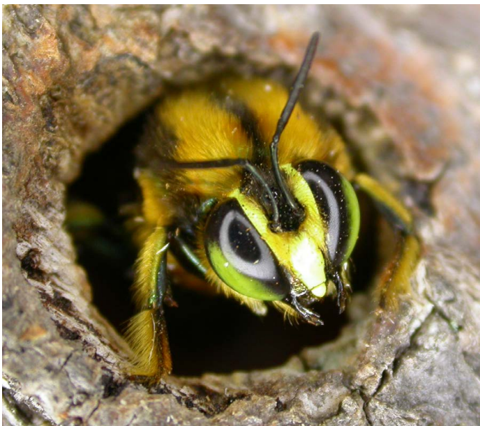
Clockwise from above: Male Green Carpenter Bee ( Xylocopa aenea ); Balsa wood substrate resembling Banksia trunks; Xanthorrhoea flower stalks; X-rays of overwintering branched nests with adult bees; a nest tunnel with brood cells. Top: Female Green Carpenter Bee.

Help us save the Green Carpenter Bee by supporting this research and conservation project.